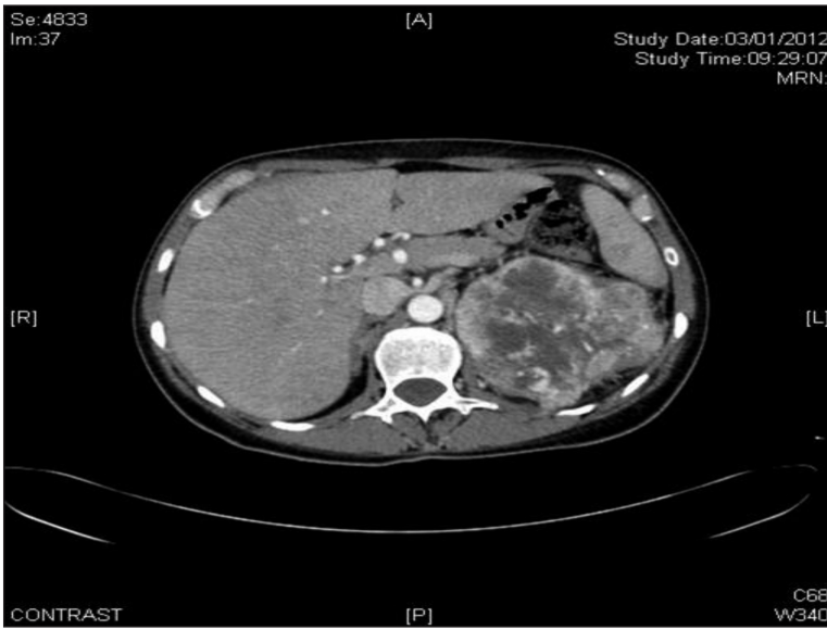
Fig. 1 - CT total body showing a gross neoplasm (about mm 87 x 102) of the left kidney with intrarenal vascularization, renal and paraortic lymphadenopathy.