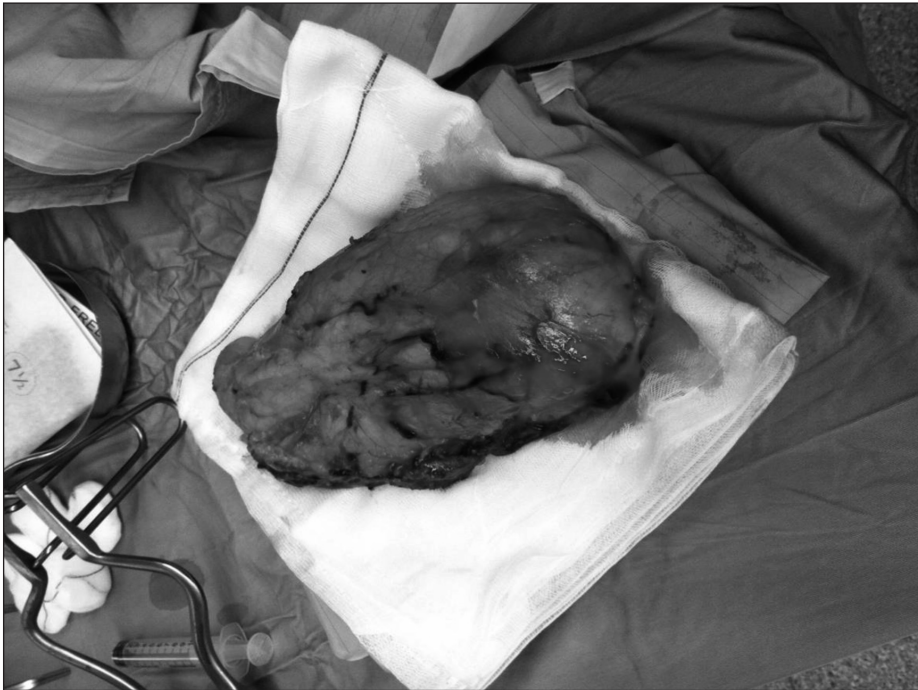
Fig. 3 - Kidney clear cells carcinoma (pT2b, pN0, G3, Stage II according to AJCC 2010); the margins of the surgical resection and the lymphnodes removed were free.

The rationale for renal artery embolization palliation is reduction of tumor bulk and providing symptomatic relief in patients with unresectable renal carcinoma or potentially resectable lesions in patients considered to be poor surgical candidates.