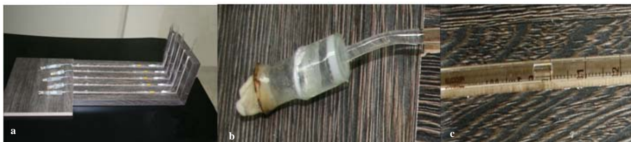
Figure 1a Fluid filtration device b A plastic tube was attached to the crowns of the teeth c Air bubble was displaced in the scaled pipette

(Figure 1c). A regular water pressure of 20cm H 2 O (this pressure was selected to stimulate physiologic condition like the marrow spaces of bone) [31] was forced crown of all samples when the pipette was placed horizontally at 24, 72 and 168 hrs and data were recorded for each sample in experimental and control groups. The displacement of the air bubble was measured by counting the pipette’s lines. Data were analyzed using ANOVA test and then T test.