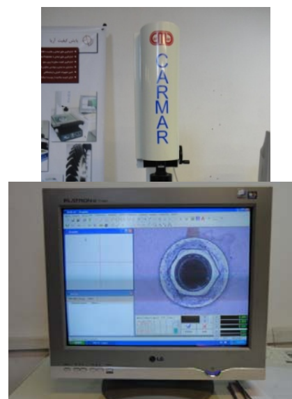
Figure 5 CMM Devices for evaluating dimensional changes

The casts were analyzed by CMM (coordinating measuring machine) devices (DEA; Italy) in three dimensions (x, y, and z) for evaluating the position of implants and dimensional changes. Therefore, they were fixed on a mounting plate using a vise for further measurements. A fine tip stylus was then adopted to record multi-axial coordinators (x, y, z) on the upper surface of hex implant and also on the casting base. The tip of the stylus was located on the center of the hex implants and calculated for six vertices of the hex and three plans (x, y, and z). Afterwards, different vector calculations were determined, in degrees, between implant angles on both the main and the duplicate cast [11-13] (Figure 5). Statistical analysis adopted in this study was Student t-test.