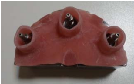
Figure 2 Acrylic customized open tray

was equipped with two guide pins in order to fit the designed tray using open tray method.