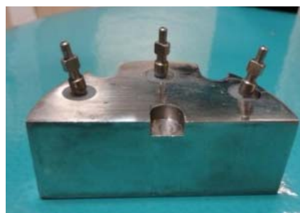
Figure 1 Master model (the control group)

The research was done through an experimental-laboratory method on 15 input samples in each group, forming a total number of 31 samples. In which each sample has 6 points (A, B, C, D, E, F). A steel model, having 8 cm diameter and 3 cm height, was produced first and then three grooves were devised for three implants (Noble Biocare; AB, Göteborg Sweden). Every two angulated implants were 5 cm apart with 3.5 cm distance from central implant. The position of implants was analyzed by the surveyor so the central implant was placed perpendicular to the casting surface while the other implants had divergence or convergence of 15° from the central component (Figure 1).