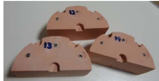
Figure 4 Dental stone, high strength (type IV) casts (experimental group)

according to instructions of the manufacturer. Casts were trimmed and coded after being cured for one hour (Figure 4).