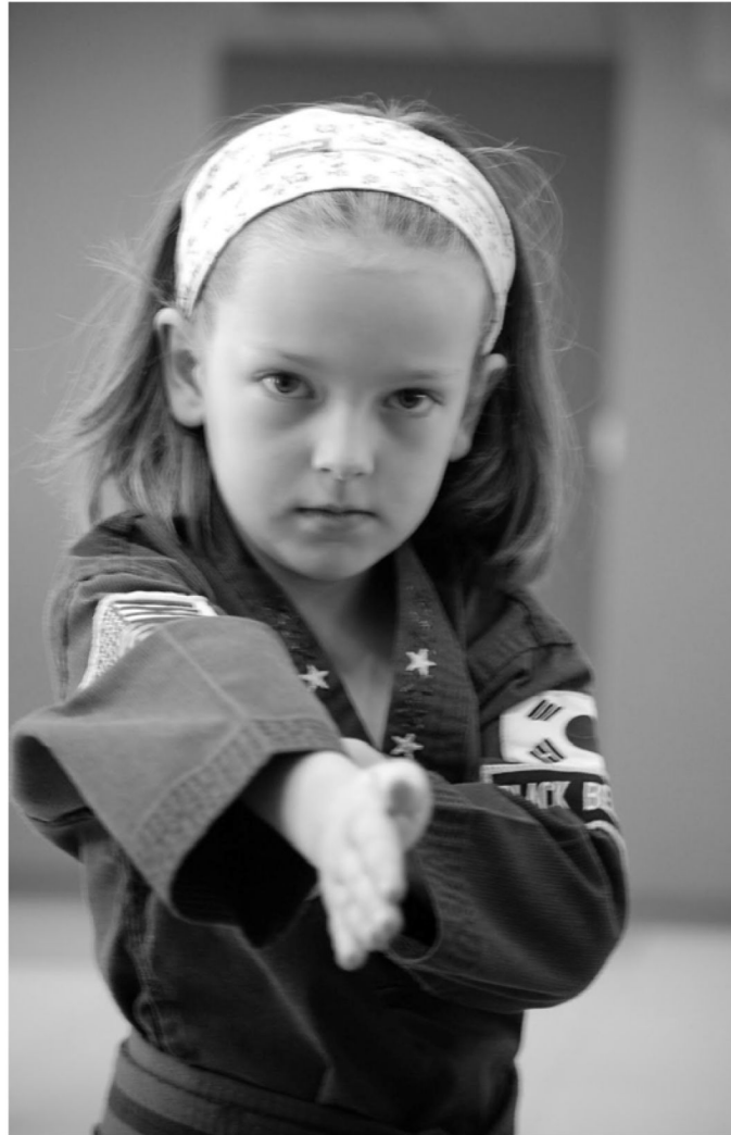
Figure 1. Child practicing a Taekwondo form.