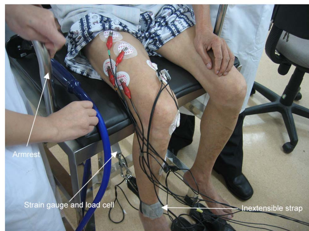
Figure 1. The functional test of quadriceps. doi:10.1371/journal.pone.0084167.g001

Endurance time. Endurance of the quadriceps was evaluated during an isometric contraction. After 10 minutes of rest following the QMVC maneuvers, subjects were instructed to maintain a tension representing 55%~60% of their own QMVC until exhaustion. The feedback mechanism served by the computer screen helped subjects to maintain the determined submaximal tension. Subjects were strongly encouraged to pursue until tension dropped to 50% QMVC or less for more than 3 seconds. Thus, quadriceps endurance was defined as the time to fatigue (QTf), and the time at which the isometric contraction at