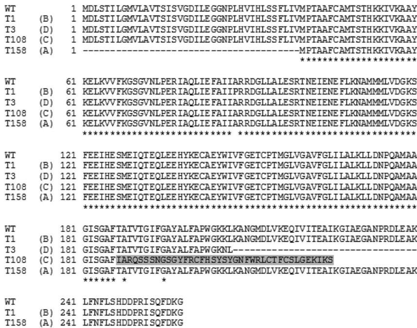
Figure 4. Amino acid alignment of MotA . The motA mutations are predicted to result in non-functional proteins. A missense mutation at base 262 (T1, Type B) resulted in an A to P mutation at amino acid 88; a nonsense mutation at base 612 (T3, Type D) resulted in a premature truncation; a duplication of 49 bp created a direct repeat within motA and led to the replacement of the last 73 residues in the C-terminus with a sequence of 39 new residues that are highlighted (T108, Type C); and a deletion at base 64 resulting in a truncated protein (T158, Type A). doi:10.1371/journal.pone.0088043.g004

CJJ81176_0920 compared to the TIGR sequence. This deletion was not present in the 81-176 strain sequenced at Yale, which was derived from the NMRC laboratory stock. The 69 bp deletion most likely affects the transcriptional start site (TSS) of cysK . CysK , the enzyme encoded by CJJ81176_0920, is involved in the biosynthesis of L-cysteine from L-serine. It remains unclear as to how this deletion happened, but an imperfect direct repeat (TTTTTAA and TTATTAA) of seven base pairs flanks the deleted region (Figure 2).