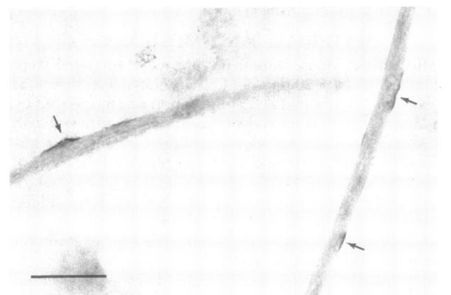
FIG. 1. Bright field photomicrograph of cultured mouse myotubes treated with NG108-15 cell conditioned medium and then stained by the \alpha -btx-immunoperoxidase method to reveal AcCho receptor distribution. Three AcCho receptor aggregates can be seen (arrows). Aggregates are more easily detected at the edge of the muscle fibers (see ref. 11). Reference bar = 25 \mu\text{m} .

The AcCho receptor-aggregation factor was produced by NG108-15 cells grown alone, and its production and action did not require serum. As shown in Table 1A, mouse muscle cultures that were fed daily for 6 days with serum-free medium that had been conditioned by contact for 1 day with cultures of differentiated NG108-15 cells had an A/M 4.7-fold larger than that of muscle cultures fed with serum-free fresh medium (control medium). In the three experiments described in Table 1, A-C, mouse myotube cultures treated with control medium had an average A/M of 0.335 (SEM = 0.032, n = 6 ), whereas cultures treated with NG108-15 cell-conditioned medium had an average A/M of 1.17 (SEM = 0.037, n = 6 ). The addition of