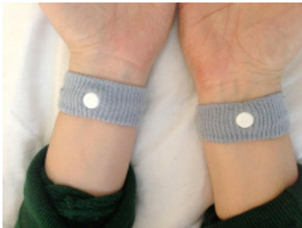
Figure 1. Location of Acupressure Wristband

Each women in acupressure group was given a pair of sea band (acupressure wristband) (Sea- Band, the U.K., Ltd., Leicester, England) and trained to use it continuously (remove only when bathing) for four days (From the fourth to seventh day) in the appropriate place in both hands. Sea band is a buttoned elastic wristband which is used to pressure on the Neiguan point.