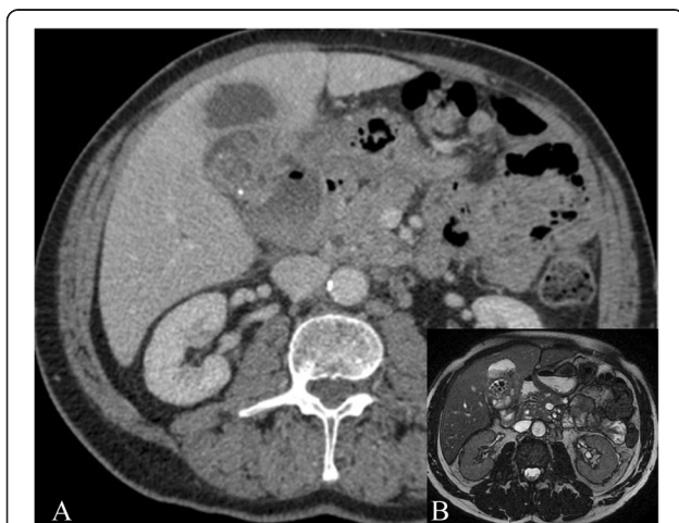
Figure 1 Preoperative Diagnostic. (A) Preop.-CT scan. A hypodense pseudocystic mass on the 5th liver segment, mimicking abscessed gallbladder cancer (bile stones are recognizable on the hilar part of the tumor). (B) MRI scan. Bubbles of free air inside the "tumour".

An ultrasound scan of the liver and an abdominal CT scan (Figure 1A) detected a disomogeneous hypoechoic-hypodense mass with many internal hyperechoic/hyperdense stones in the 5th segment of the liver. In addition, a cholelithiasis with two small stones in the common bile duct was present. Differential diagnosis between hepatic abscess or gallbladder cancer remained open. An abdominal MRI scan confirmed the above mentioned findings with the evidence of a few bubbles of free air suggesting spontaneous perforation of the gallbladder (B). An ERCP was then performed and the choledocolithiasis was resolved through a papillotomy. Afterwards a surgical exploration was planned. The operation started with a laparoscopic approach to confirm the suspected diagnosis and exclude tumor diagnosis and even more important peritoneal tumor spread that would be a contraindication to radical R0-surgical resection. Laparoscopy showed a bulging lesion involving the gallbladder, liver, great omentum and duodenum, (Figure 2A) while no signs of peritoneal carcinomatosis were detected. We then decided to convert to