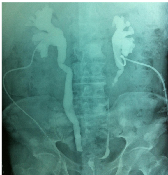
Figure 3 Drip infusion pyelogram showing important dilatation of the upper urinary tract with a partial defect of the distal ureter.