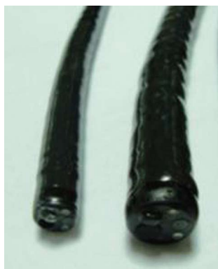
Figure 2 Relative diameters of an ultra-thin endoscope (left, 5.9 mm) and a standard gastroscope (right, 8.8 mm).

tion-related complications, sedation-related work loss, post-procedural monitoring and post-procedure transportation. In several studies, the cost-effectiveness of unsedated TNE was investigated. They found that the mean procedure time, recovery time and cost of unsedated TNE was significantly lower than sedated TOE [12,40] .