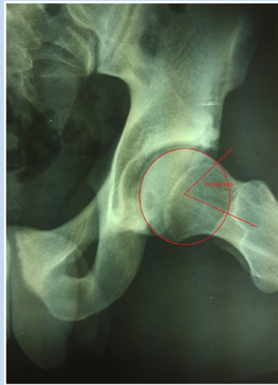
Figure 1. Frog-leg lateral radiograph of a patient with a cam lesion. The alpha angle is measured by drawing a perfect circle around the femoral head and identifying the point where the contour of the femoral head leaves this circle. A line is drawn down the center of the femoral neck and through the center of the perfect circle. A second line is drawn through the center of the circle and through the point where the femoral head leaves the perfect circle. The angle between these 2 lines represents the alpha angle. An angle greater than 55^\circ was considered radiographic evidence of a cam lesion.

Cam lesions were identified by measuring the alpha angle on the frog-leg lateral radiographs. 5 The alpha angle on the frog-leg lateral films was measured by drawing a best-fit