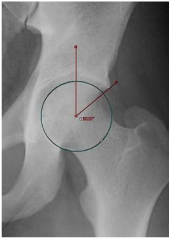
Figure 2. Anteroposterior radiograph of a male athlete with elevated lateral center-edge angle. The lateral center-edge angle was formed by a line connecting the lateral edge of the acetabulum with the center of the femoral head and a line perpendicular to that connecting the ischial tuberosities. A lateral center-edge angle of greater than 40^\circ is typically considered to represent acetabular overcoverage consistent with a pincer lesion.