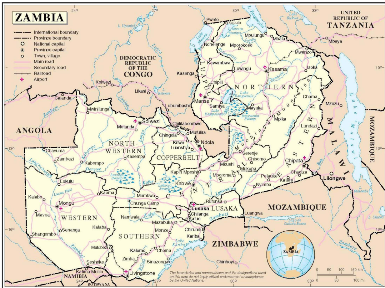
Figure 1. Zambia Map No. 3731 Rev. 4 reprinted under a CC BY license, with permission from the United Nations, original copyright January 2004. doi:10.1371/journal.pone.0089102.g001