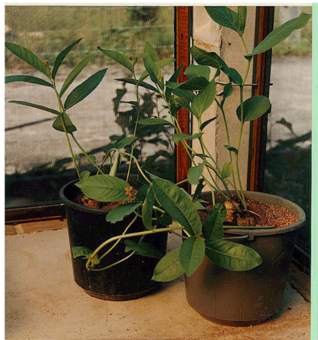
Fig. 1 Jatropha elliptica (Pohl) Muell Arg. cultivated in greenhouse

In the present paper, we report the evaluation of schistosomicidal, miracidicidal or cercaricidal activities against Schistosoma mansoni and/or molluscicidal activity