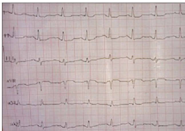
Figure 1c: Serial electrocardiograms