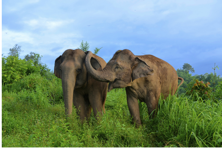
Figure 1 Physical contact between elephants following distress included trunk touches to the genitals, mouth and the rest of the head (as seen here). Photograph taken by E. Gilchrist at the Golden Triangle Asian Elephant Foundation, Chiang Rai, Thailand.