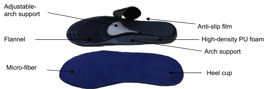
Figure 1 The heel cup was made up of a high-density polyurethane (PU) customized insole with an arch support insole for the participants. The adjustable sandwich insole is constructed with super-thin Velcro. It is a single modularized custom-made insole with adjustable inserts. The microfiber or natural leather layer is wear-resistant and moisture wicking, which keeps feet dry and comfortable. The high-density breathable PU layer is designed for long-term use without deformation and protects the foot by dampening shocks.

reliable balance index can be easily obtained; thus, the system was suitable for large sampling measurements and balance evaluation in specific people.