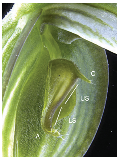
FIG. 3. Labellum of Pterostylis sanguinea . Letters refer to landmarks used when describing the copulatory behaviour of the pollinator on the flower. A, apex; LS, lower section; US, upper section; C, callus.

How many species of fungus gnats are involved? Thirteen populations of P. sanguinea were visited to collect pollinators (Table 2), using two approaches: (1) baiting for 12 periods of 5 min at each site, during which any visitors to the flower were collected; (2)