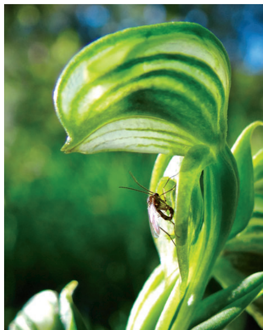
FIG. 4. Male fungus gnat (genus Mycomya ) showing copulatory behaviour with the labellum of Pterostylis sanguinea .

Description of behaviour of the pollinator on the flower. During behavioural observations, a total of 135 gnats were observed alighting on the study flowers. Due to the small size of this gnat species, it was not possible to accurately judge how many gnats approached the flowers in flight but then flew away without alighting. Similarly, it was difficult to observe gnat behaviour as they arrived at the flowers in flight. However, on the few occasions when the sunlight was at a suitable angle, it was observed that the gnats arrived at the flower after flying 10–30 cm above