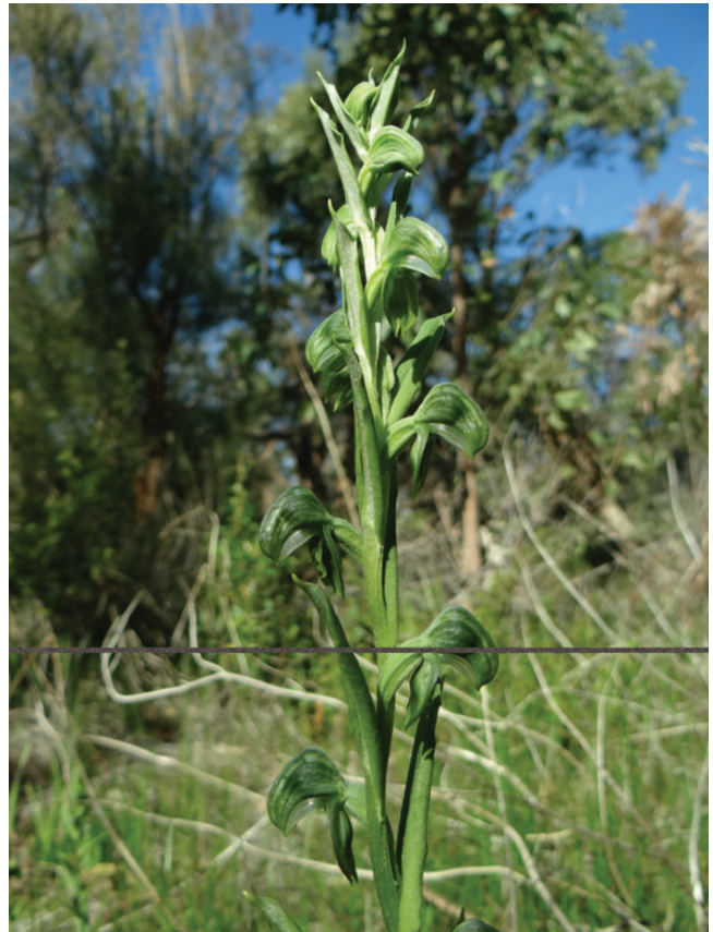
FIG. 1. Pterostylis sanguinea , illustrating flowers and growth habit. In the study region, larger individuals regularly grow to 40 cm.

Pterostylis sanguinea is a common and widespread species ranging across south-western Australia, southern South Australia, Victoria and Tasmania (Jones, 2006; Hoffman and Brown, 2011). Flowering occurs in winter, with peak flowering in June and July (Hoffman and Brown, 2011). Two to five flowers are typically produced per stem, but large individuals can produce 12 or more flowers with up to four flowers open at any one time (Fig. 1; Hoffman and Brown, 2011). Flower colours range between red-brown and green, with various colour forms often co-occurring within a population. Pterostylis sanguinea is self-compatible but reliant on a pollen vector for pollination (Retter, 2009). Thus far, the pollinator of P. sanguinea has not been recorded, although an unidentified species of fungus gnat (Mycetophilidae) has been found dead in some flowers (Retter, 2009).