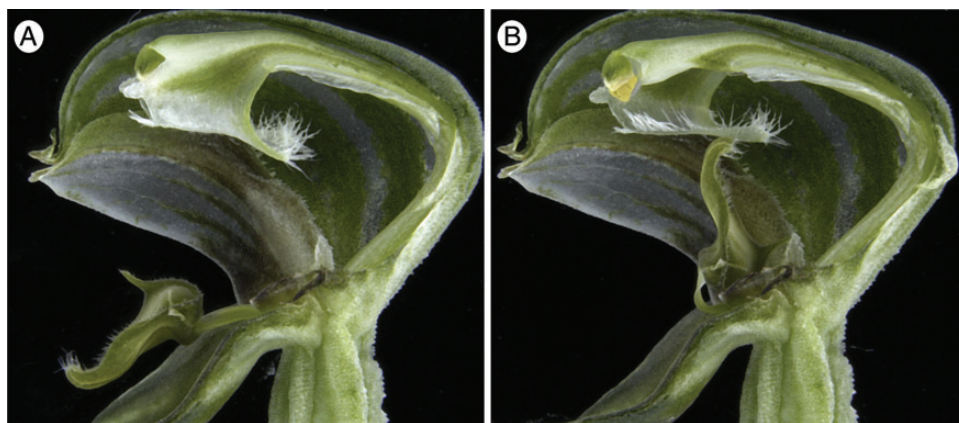
FIG. 2. Demonstration of the hinge mechanism and internal structure of the galea of Pterostylis sanguinea . (A) Flower with the hinge ready to trap a pollinator. (B) The labellum has triggered and moved into the 'up' position and the column wing has been removed to show the passage through which the gnat must move to exit the flower. The flower is approximately 10 mm across the galea.

Observations of the trap mechanism and movement of the pollinator through the flower have been published for the closely related Pterostylis vittata (Sargent, 1909). However, based on the region where Sargent made his observations, it is likely that these plants were actually P. sanguinea . For pollination to occur, the pollinator must make contact with the labellum, which then swings upwards, trapping the gnat within the galea (Sargent, 1909) (Fig. 2). The labellum remains in this position, keeping the pollinator trapped within the flower, where it flies upwards, keeping it in regular contact with the column (Sargent, 1909). After several minutes the pollinator crawls through the passage formed by the column wings (lined with angled bristles to ensure one-way movement of the insect), bringing it into contact with the lightly hinged anther, which then deposits the pollinia as it leaves the flower (Sargent, 1909) (Fig. 2). This one-way passage of the pollinator effectively prevents self-pollination. Sargent (1909) estimated that the labellum takes approximately 2 h to reset, but noted that the time was delayed by cool conditions.