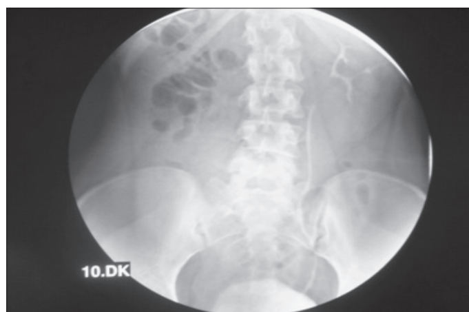
Figure 2. Intravenous pyelography, absent right kidney

where ipsilateral renal and Mullerian duct anomalies were produced following the destruction of the caudal portion of the mesonephros (12). On the affected side, Mullerian ducts cannot fuse, resulting in a didelphic uterus, and cannot come into contact with the urogenital sinus centrally, forming two separate vaginas with one obstructed (3).