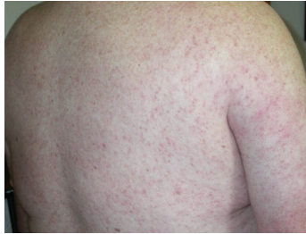
Figure 1. Diffuse maculopapular rash associated with West Nile virus infection.

Although elderly persons with WNF may experience adverse outcomes and have a higher mortality rate than younger symptomatic persons [4,8], most patients experience complete recovery. Some otherwise healthy persons, however, may continue to experience persistent fatigue, headaches and difficulties concentrating for days or weeks following infection [14]. In particular, profound fatigue, sometimes interfering with work or school activities, may last for months among persons recovering from WNF [15]. Deaths among persons with WNF occur primarily among older persons and the immunocompromised population and are frequently attributable to cardiopulmonary complications [16].