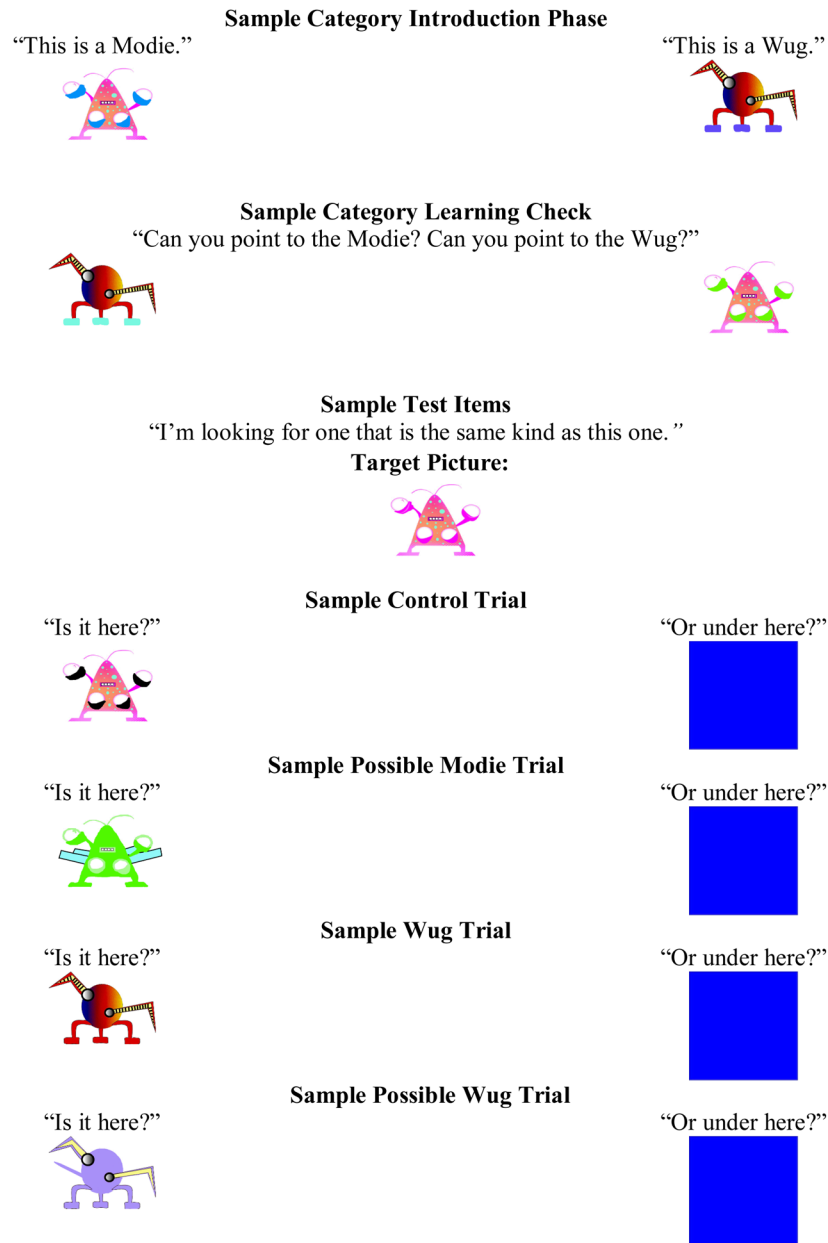
Figure 3. Sample Stimuli, Study 2