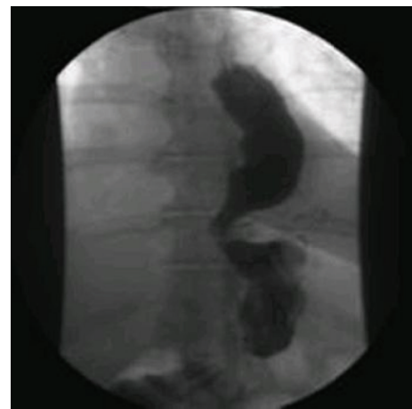
FIGURE 3: Pouch dilatation following sleeve gastrectomy.

surgery. It is vital that a clear understanding that revisional surgery can be two or three times more demanding on both the patient and the surgeon as compared with the original primary procedure.