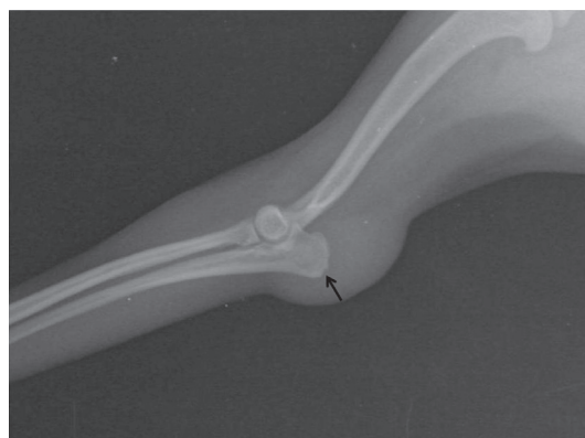
Fig. 2. Mediolateral radiographic views of the left elbow joint. Note swelling on the elbow joint and a fleck sign (arrow) on the olecranon region of the insertion of the triceps tendon.