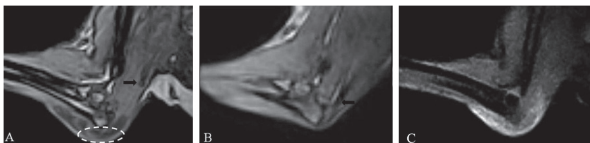
Fig. 3. Preoperative magnetic resonance images of the left (A, C) and right (B) elbow joints. Sagittal T1-weighted imaging reveals olecranon bursitis (dotted line) and displacement of the triceps tendon (arrow) (A). Note normal insertion of the triceps tendon (arrow) into the proximal olecranon on sagittal T1-weighted imaging (B). There is an evidence of high signal intensity around the elbow joint on sagittal fat-suppressed T1-weighted image (C).

to the proximal olecranon (Fig. 4b). Additionally, several simple interrupted sutures using polyglyconate (Maxon, Covidien, Mansfield, MA, U.S.A.) were placed between the tendon and the remaining tissues on the olecranon. Subcutaneous tissue and skin closure was routine.