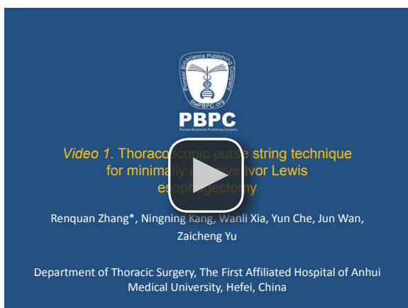
Video 1 Thoracoscopic purse string technique for minimally invasive Ivor Lewis esophagectomy.