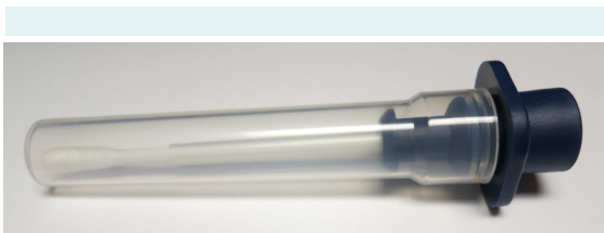
FIGURE 1. View of a Net Bio BioChipSet swab.

Collection of reference samples can be obtained from TIP victims through a simple buccal swab. Swabs were obtained from NetBio (Waltham, MA, USA). (Figure 1). These known samples can be collected by a variety of service personnel with a minimum amount of training who come in contact with the victims. Trained investigative personnel obtained samples during ongoing undercover investigative efforts. In some instances, trained undercover personnel took the buccal samples from victims with their consent. Other times, after having been informed of the process and having voluntarily consented to the sample collection, the victims stated they were more comfortable collecting the sample themselves, and were subsequently allowed to do their own buccal swab collection under the careful observation of the trained undercover personnel.