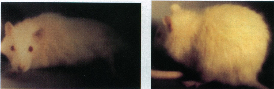
FIG. 3. Representative F344 rats at the end of the study. (Left) Untreated 24-mo-old female rat. (Right) AG-treated, sex-, age-, and weight-matched rat.

Most dramatic, however, was the amelioration of albuminuria and proteinuria as a result of AG treatment, especially prominent in the older S-D rats. Although in humans frank proteinuria is not present in the absence of glomerular injury, microalbuminuria has been associated with an increased risk for cardiovascular disease (37, 38). In the present study, the coordinate suppression by AG of this marker of vascular disease, of the increase in cardiac size, and of the loss in NO • -dependent dilatory tone may provide a novel unified