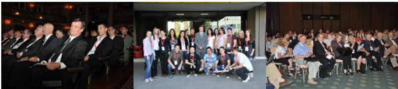
Figure 7. MIE Conference in Sarajevo: a) Opening ceremony; b) LOC staff; c) Participants of one of the main sessions (Sarajevo, 2009)

tatives of industry and consultancy in the various health fields.