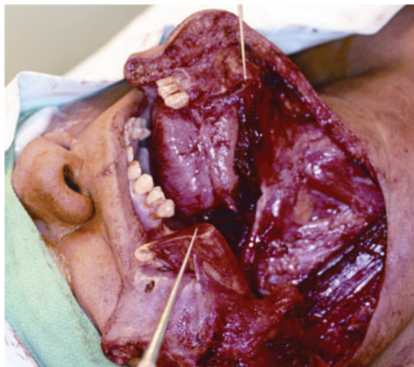
Fig. 1 Traditional approaches to early-stage tumors of the oropharynx require division of the lip and mandible and release of the tongue base, resulting in significant aesthetic and functional morbidity.

due to the local fibrosing effects of radiation. Studies evaluating intermediate and long-term adverse events following chemotherapy and irradiation showed that patients may still suffer from significant functional impairment, including persistent swallowing difficulties and dysphagia, xerostomia, diminished vocal ability, and airway compromise with a higher risk for aspiration. 4-7 In one study, chemoradiation therapy was shown to be associated with 4% treatment-related death, 6% osteoradionecrosis, 12% chronic aspiration, 12% nonhealing ulcers, and 42% serious adverse events. 8 For these reasons, the pendulum has swung back in the direction of a more reasonable middle ground between debilitating surgery and debilitating chemoradiation.