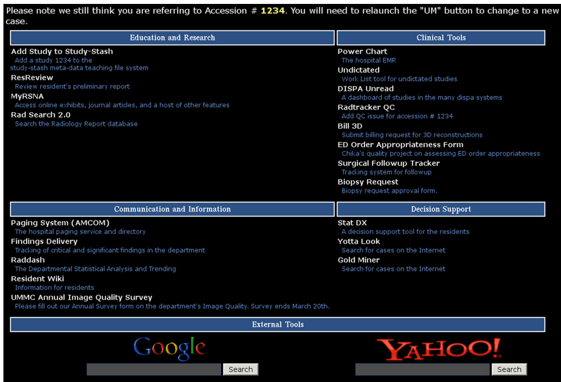
Fig. 2 Depicts an example of a context portal used to integrate several applications with a PACS client

[17–27] regarding or mentioning the use of a wiki. In 2012, there were 231.