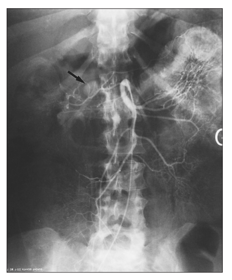
FIG. 2. Selective catheterization of superior mesenteric artery demonstrates extravasation of contrast medium (arrow) in fourth portion of duodenum, confirming bleeding at that site. No underlying anatomic abnormality is seen.

Since the diverticular wall is most often composed of mucosa, submucosa and muscular fibres, most au-