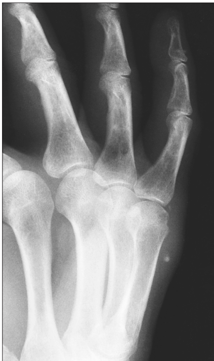
FIG. 1. Patient's right hand showing ossification adjacent to the involved fifth metacarpophalangeal joint.

Under intravenous regional anesthesia, with a tourniquet, the extensor mechanism was identified through a transverse dorsal incision over the MP joint and divided longitudinally to expose the joint capsule. The dorsal capsule was expanded and extended proximally along the metacarpal. Division of the capsule revealed thickened inflammatory synovium, with numerous chondrous nodules both in the wall and lying free. Although continuous with the joint, these loose bodies were well contained within the dorsal pouch