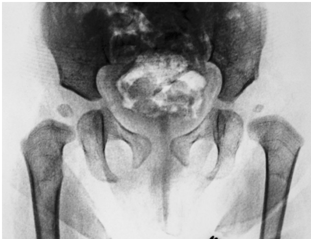
Fig. 3 Inverted contrast anteroposterior pelvis radiograph demonstrating the common proximal femoral physis; O'Brien's Line

related radiographic changes. Tethering of the greater trochanter is convenient to perform at the time of examination under anesthesia, arthrogram, and open adductor and iliopsoas tenotomy. We chose a lateral flexible tether because, when compared to ablative procedures such as a Phemister bone block, drilling or a vertical screw, the femoral neck growth is optimized rather than restricted. This was reflected in the screw divergence noted at follow-up.