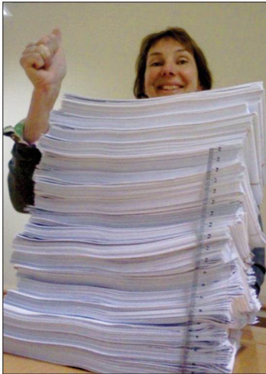
Figure 1. Paperwork required for regulatory review of the research described in panel 1