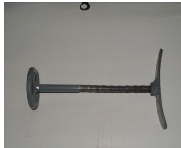
Figure 4: T-shaped side arms which grip the oxygenator within the circular main frame at 2, 5, 7 and 11 O'clock positions