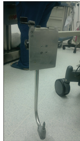
Figure 2: Jostra (MAQUET) oxygenator holder