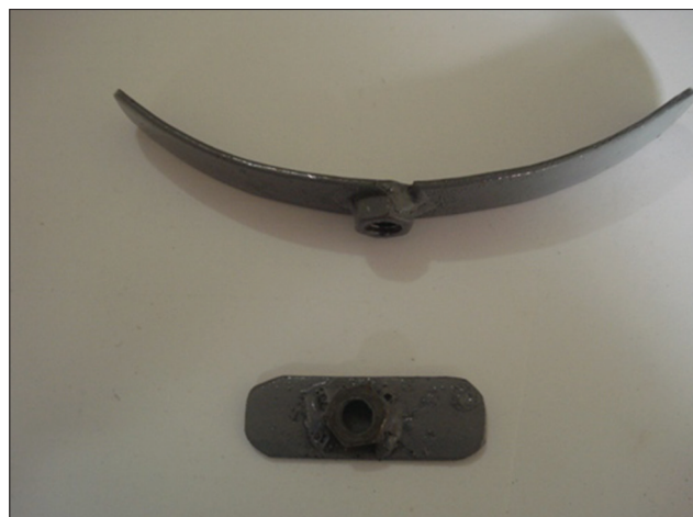
Figure 5: Two crosses of the T-shaped side arm (a straight and a curved)

include, (i) it requires some time to fit, (ii) extreme caution is required in fitting the oxygenator to avoid breakage, (iii) a spanner is required to lock the latch.