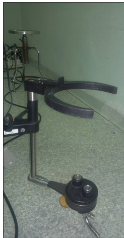
Figure 1: Dideco (EVOS, EOS) oxygenator holder