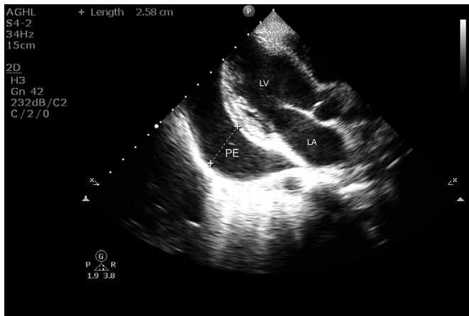
Fig. 1. Transthoracic echocardiogram: parasternal long axis view showing massive pericardial effusion.

Following an initial improvement of several days' duration, symptoms recurred. Repeat echocardiography revealed moderate collection of serous clear pericardial fluid. Child was subjected for further investigations. Serology for selected viral pathogens like human immunodeficiency virus, Epstein–Barr virus, cytomegalovirus and herpes virus were all negative. Serologic markers for autoimmune diseases and streptococcal infection were negative. Considering exudative nature of the pericardial fluid and definite positive history of contact to tuberculosis, tubercular pericarditis was suspected and anti-tubercular drugs and oral prednisolone were added empirically. General condition of the patient became improved within few days following initiation of anti-tubercular therapy. The patient was discharged home with the advice to attend follow-up clinic.