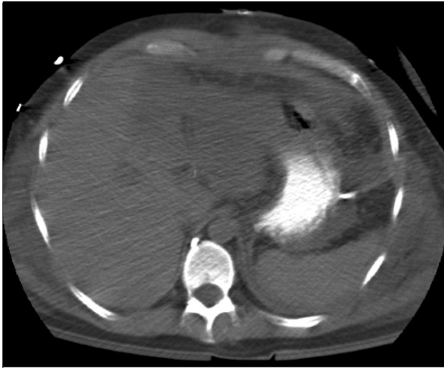
Figure 1 Nasogastric tube tip seen outside the stomach lumen instead of Nasogastric tube tip seen out with the stomach