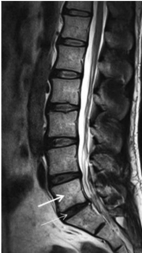
Fig. 2. Sagittal T2-weighted MRI of man with lumbarization of S1 vertebra (thick arrow). There is well-formed S1-2 disc (thin arrow) with squaring of S1 vertebral body (thick arrow).

Note. — LSTV = lumbosacral transitional vertebra