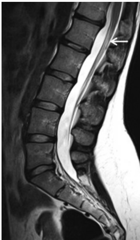
Fig. 5. Sagittal T2-weighted MRI of woman with normal lumbar segmentation shows that conus medullaris (arrow) is located at L1 body.

A. Proximal right renal artery (arrow) is located at L1–2 disc space. B. Root of superior mesenteric artery (arrow) is positioned at L1 body. C. Aortic bifurcation (arrow) is located at L4 body.