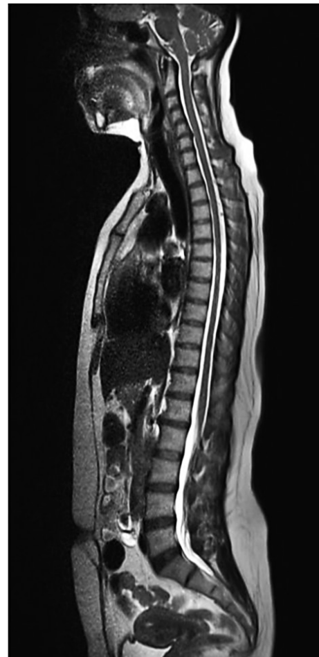
Fig. 1. Example of sagittal whole-spine localizer image with half-Fourier acquisition single shot turbo spin-echo sequence for numbering lumbar vertebrae.

Sagittal WSL was used as a golden standard in identification of vertebral levels and the diagnosis of LSTVs. The vertebrae were counted down from C2, assuming that there were seven cervical and twelve thoracic vertebrae.