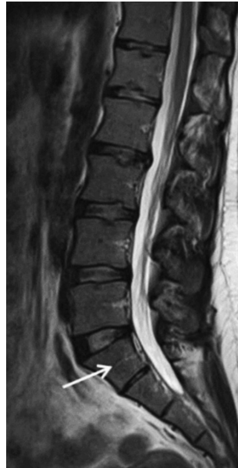
Fig. 3. Sagittal T2-weighted MRI of woman demonstrates sacralization of L5 vertebra (arrow). L5 body shows rhombus shape similar to S1 vertebra.