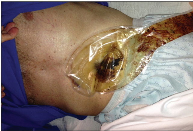
Figure 3) Nil output in the stoma bag three days after initiation of feeds confirming the success of the procedure

facilitating closure. The standard treatment approach for fistulas is surgical closure; however, most of the patients in this population are poor surgical candidates secondary to their underlying comorbid conditions (3). Other nonsurgical procedures that have been used with variable success include electric and chemical cauterization, argon plasma coagulation, endoscopic suturing, collagen plugs and fibrin glue (4,5).