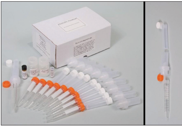
Figure 1) The Accufilter (Cellometrics Inc, Canada) device