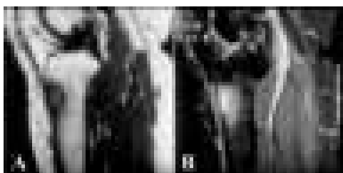
Figure 1. MR showed a 3x2 cm hypointense mass in T1 sequences (A) and heterogenic hyperintense lytic mass in SPIR sequences (B).

A 60-year-old woman presented to our hospital with a four-month history of increasing pain in the right knee. No difference was noted in pain character with motion and at rest. Pain was localized in medial tibial metaphysis. Local tenderness and painful arch of knee motion were observed without any tumoral tissue clinical inflammatory findings. She had no history of fatigue, cough, weight loss, diabetes, night sweats or of a malignancy. The blood count and CRP were within normal range. Sedimentation rate was elevated. A plain radiogram revealed a lytic lesion in proximal metaphysis of tibia. Computed tomography showed a lytic and exocentric lesion starting