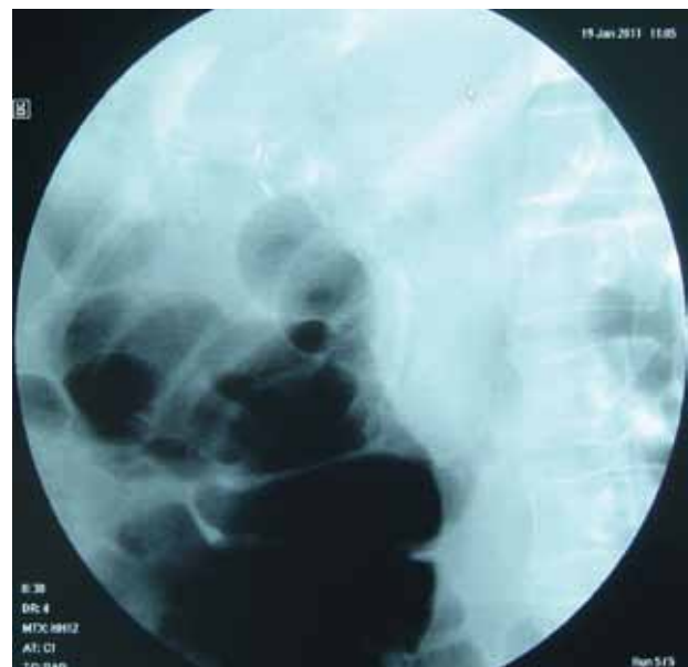
Figure 2 Radiograph showing a Tannenbaum stent (Wilson-Cook, Athens) inserted proximally to the site of the bile leak.

impaction [9,10]. The stents were removed after an interval of four to eight weeks. Patients with CBD or CHD leak and associated stenosis were followed for possible development of biliary stricture with liver function tests and US every three months in the first post-procedure year. MRCP or ERCP was performed only in the case of clinical symptoms or abnormal liver function tests or US.