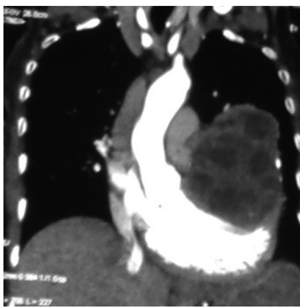
Figure 2. CT Scan Showing Hydatid Cyst in Pericardium

Patient's trachea extubated and Intraoperative and