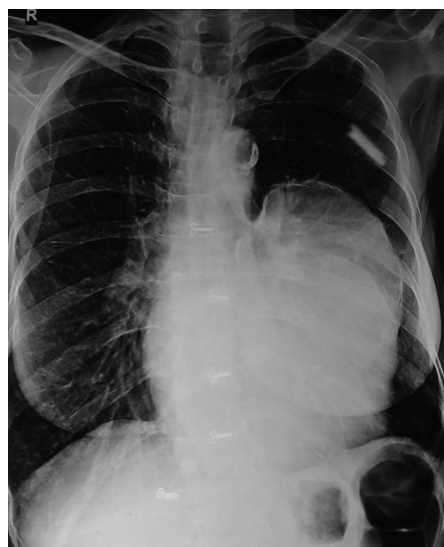
Figure 1. Chest X-Ray Showing Bulging of Left Heart Border

was 110 beats per minute, SpO 2 94% on room air and respiratory rate was 24 breaths per minute. On auscultation, the lungs were normal and no cardiac murmur, no JVP raised or gallop rhythm was noted. Cardiac enzymes, biochemical analysis, and complete blood count were normal except for eosinophilia. Chest radiography noted that cardiomegaly with bulging left heart boarder at admission (Figure 1).