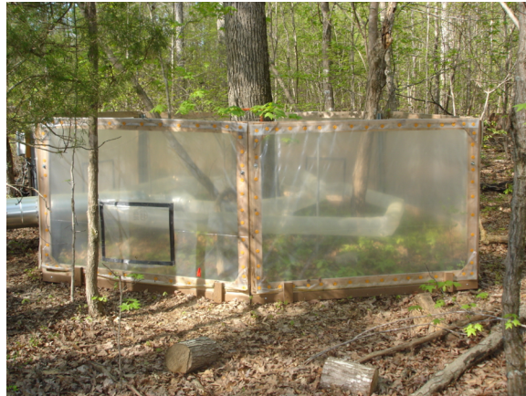
Figure 1 Warming chamber at Duke Forest.

1.5°C to 5.5°C in 0.5°C steps using air warmed by hydronic radiators, while the three control chambers blow air at ambient temperatures into the plots (see Pelini et al., 2011b for a detailed description of the chambers). Warming treatments have been maintained continuously since January of 2010 and have been successful at maintaining the targeted temperature increases. For 2011, a significantly positive relationship between the target temperature and actual temperature increase was maintained ( p < 0.01 , R^2 = 0.99 ).