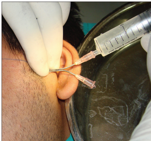
Figure 3: Arthrocentesis procedure

The increase in mouth opening was calculated for each patient at day 1, 3, 14, 45, and at the end of 90 days. In eight patients, mouth opening increased significantly more than 12 mm. In seven patients it remained the same as they had sufficient mouth opening, but were treated for other symptoms. The mean increase was found to be 7.87 mm with SD of 7.21 mm using Student’s paired t -test and was found to be statistically highly significant ( t = 4.483, P < 0.001) [Table 2 and Figure 4].