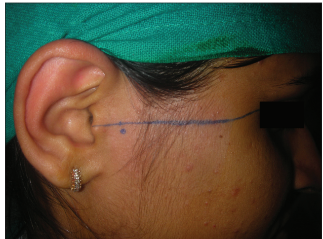
Figure 2: Landmarks