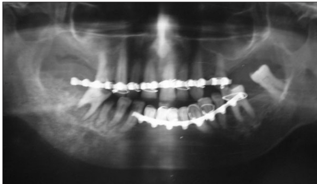
Figure 2: Orthopantomogram showing signs of sclerosis and new bone formation in the body of right mandible along with signs of patchy bony destruction near the root of molar and premolar teeth (or) OPG showing lesion extending from right side of canine upto ramus of mandible