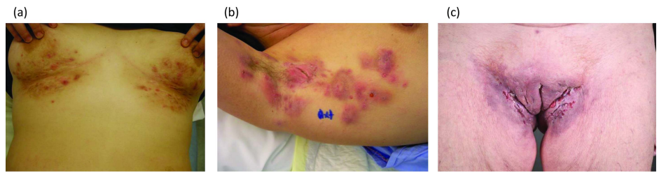
Figure 2 Typical clinical presentation of active hidradenitis suppurativa (HS). (A) Moderate Hurley grade II. (B) Severe Hurley grade II. (C) Hurley grade III.

than women to develop severe HS, 13 25 and associations between smoking and obesity and more severe disease have been reported. 16