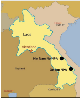
Figure 1. Map of survey sites in Khammouane and Salavan provinces, Laos.