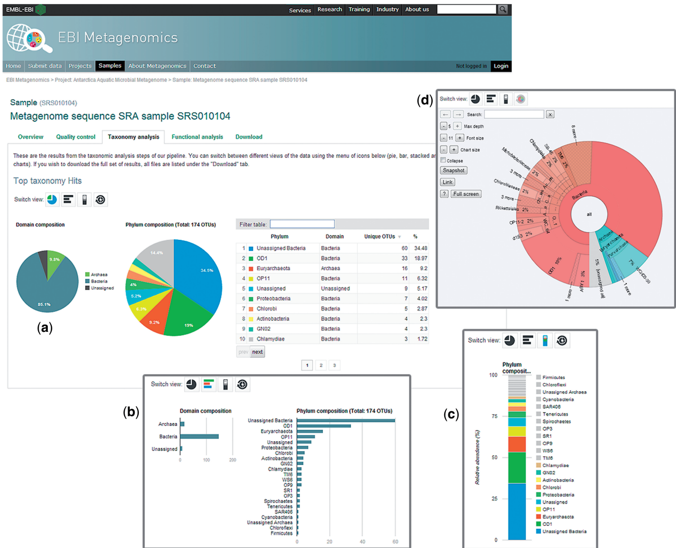
Figure 3. Screenshots of the analysis results pages where users can visualize the outputs of the analysis pipeline in a number of formats. A pie chart (a) summarizing the OTUs present in the sample is shown by default on the taxonomy results page and users can switch between a bar chart (b), stacked chart (c) and interactive Krona viewer (d) by selecting an icon from the ‘switch view’ menu.

considered to be state-of-the-art resources for analysis of metagenomics data. EBI metagenomics represents an additional complementary analysis resource that builds on EBI expertise in sequence data archiving and analysis. Uniquely, its close integration with the ENA means that users can be confident that their data are stably archived, and receives accession numbers—a prerequisite for many publications. Provision of the Webin and ISA tools streamlines the submission process and ensures that all required data are captured and described appropriately. The InterPro-centric approach to functional analysis, meanwhile, provides a powerful and sophisticated alternative to BLAST-based approaches, and use of the GO to annotate results means they are directly comparable with data in other resources that use GO terms for annotation, such as UniProtKB (36).