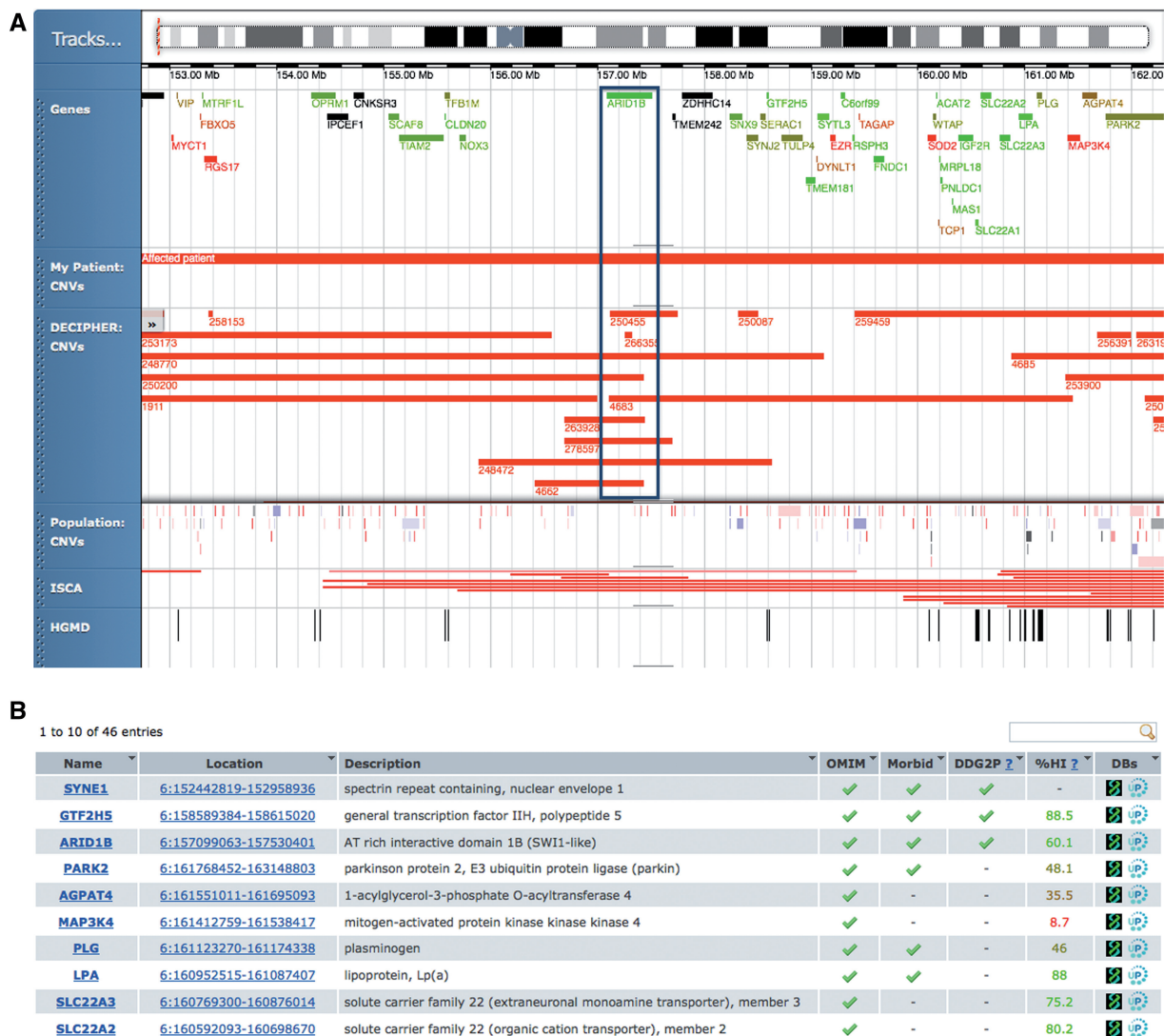
Figure 1. Discovering clusters of patients with a 6q25.3 deletion involved with intellectual disability. Search in DECIPHER for 6q25.3 identified patient 250481 with a 9.5-Mb deletion in 6q25.3. (A) Interactive visualization of genes overlapping deletion in patient 250481 and other patients that have similar deletions in 6q25.3 in DECIPHER and ISCA (17) databases. Overlapping genes are coloured by their propensity to display haploinsufficiency (18). (B) Prioritizing genes affected by a deletion event in patient 250481. List of all affected genes with associated properties. At least three genes have OMIM Morbid entries and are present in the curated list of genes known to be involved in developmental disorders (DDG2P). (C) Identifying other patients with shared phenotypes. Details of overlapping patients with shared phenotypes are highlighted in bold. Most patients appear to display intellectual disability and have a common overlap (see boxed area in Figure 1A) on ARID1B . (D) Gene ARID1B entry in the DDG2P database. Deletions affecting this gene are a cause of intellectual disability.

deposited variant with data imported from the Ensembl Variant Effect Predictor (VEP) (23). These include affected gene/s, location (coding, upstream, regulatory regions, etc.) and consequence of the variant (missense, nonsense, stop gain/loss, frameshift, etc.). We have also integrated information from various bioinformatics sources for the affected gene with outgoing links to relevant clinical, genomic or protein resources. An additional tab provides all predictions from Ensembl VEP for the deposited location (Figure 2B). This information contains, among others, predicted consequences using Sequence Ontology (24) terms as well as PolyPhen (22) and SIFT (21) predictions for all known transcripts with associated Human Genome Variation Society (HGVS) (25) identifiers.