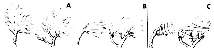
FIG. 3. A: Conformation of P. cembra seedlings at 0.5 m/sec wind speed; B: the same seedlings at 15 m/sec; C: simulated high wind speed conformation of these seedlings using thread. Wind speed is 0.5 m/sec.

where D is the diffusion coefficient of the gas; n , the number of